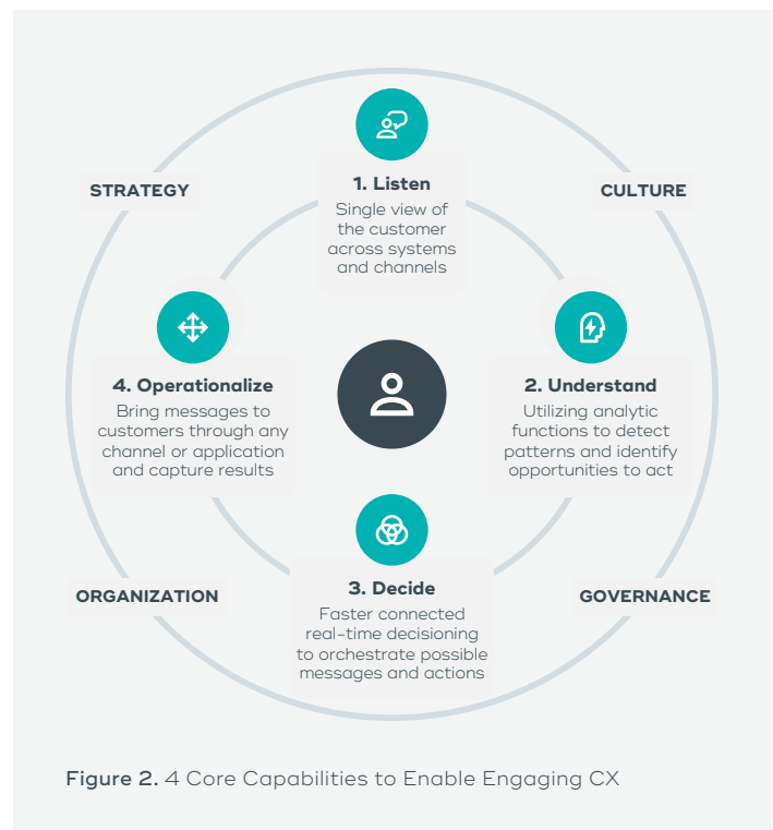
Figure 2. 4 Core Capabilities to Enable Engaging CX