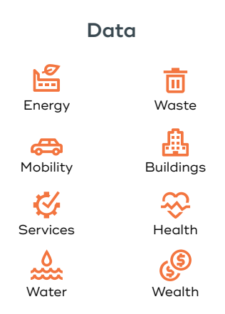
Figure 2. Smart Data Management